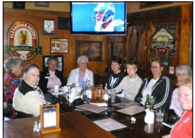
Lions gathering after the CIBC Run for the Cure!